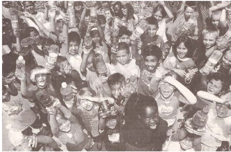
May 30, 2006 The Sun San Bernardino County

The First Grade Class of 2005/2006 recycled aluminum cans and plastic bottles for a year to raise money to buy an acre of land for the Mojave National Preserve.