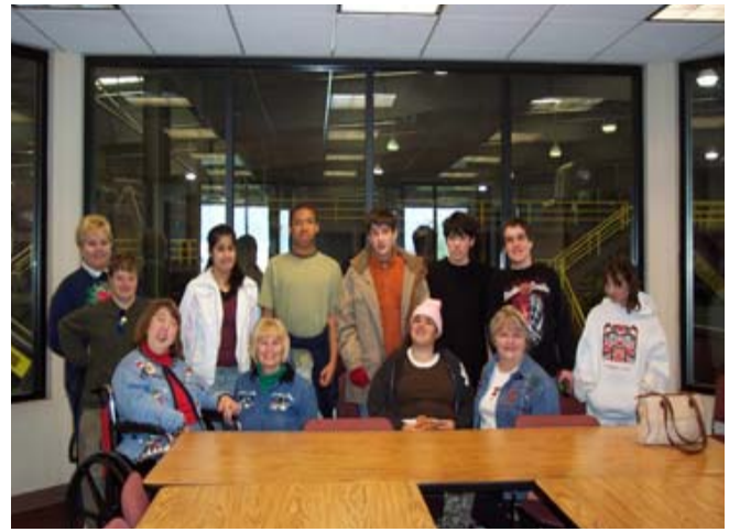
West Valley Material Recovery Facility, Fontana