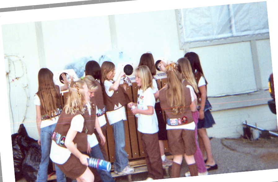
Recycling container located at Erwin Lake Park, Big Bear, CA.