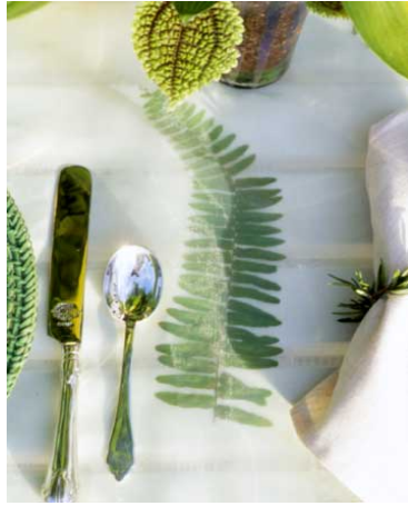
Boston ferns are shown here but other leaves such as palm, basil or ivy works just as well.

It's easy to liven up your table by nestling a few pressed leaves between two sheer tablecloths, as shown at the right. A few days before the party, snip several leaves from a garden or houseplant, and place them between the pages of a large book, protecting the book with sheets of tissue paper. After 48 hours, remove the leaves and randomly scatter them between the cloths, making sure to leave empty spaces for the place settings.