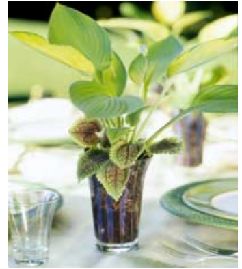
Coleus is used here, but any colorful leaf or flower can be used.

Create a spectacular display with coleus' colorful leaves. This easy-growing annual makes a great houseplant, too!